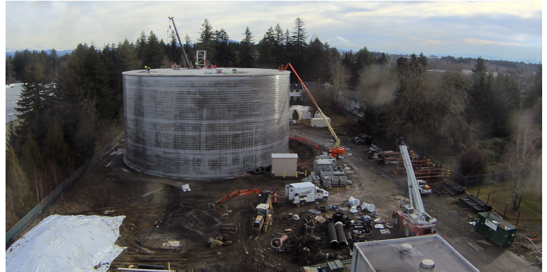
Cascade Reservoir 2. Photo taken January 10, 2023