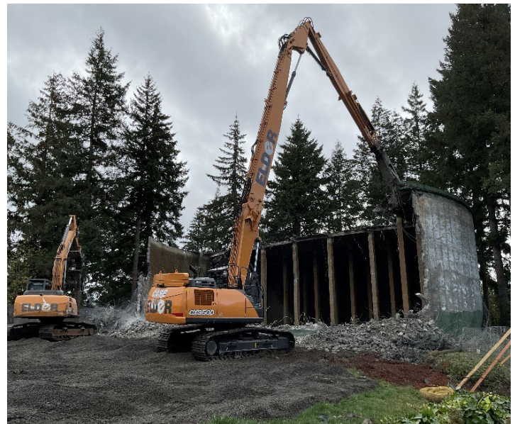
60-year-old reservoir demolished to build modern one.