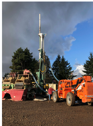
Cascade Well 7 Drilling Project. Drilling is scheduled to be completed by March 2020.

A: Under the current agreement, we contract to buy 2.8 billion gallons per year, which cost $3,165,984 in fiscal year 2019/2020. Projected costs at this time are estimated to be over $12 million dollars per year by the year 2030.