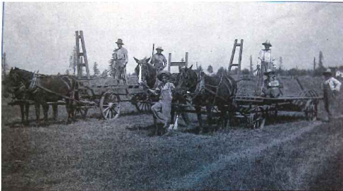
Burns property at 181st and Halsey

The 1920s were a fertile time and Rockwood was growing, just like the rest of Multnomah County. Without a reliable water supply, the community could not continue the transition from farms to houses. A few early visionaries championed the idea of a Water Special District, which would bring water (and indoor plumbing) to all the houses of the area.