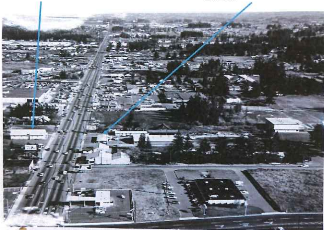
Photo of Stark Street toward the east taken in 1970.

In 1967, the District built a new 1 million gallon reservoir at the Grant Butte site. In 1970-1971, the District spent $100,000 on improvements to stabilize the site; however because of the instability of the hill, the reservoir was never put into service and demolished in 2008.