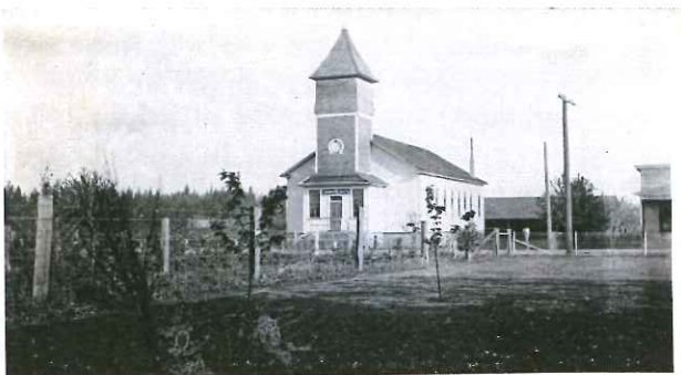
Rockwood Grange Hall circa 1915. Photo courtesy Gresham Historical Society Research Library image #1424

On April 4, 1925 a Special Election of the area residents was held in the Rockwood Grange Hall on Baseline Road near 182nd Street and Rockwood Water District was incorporated on April 18, 1925.