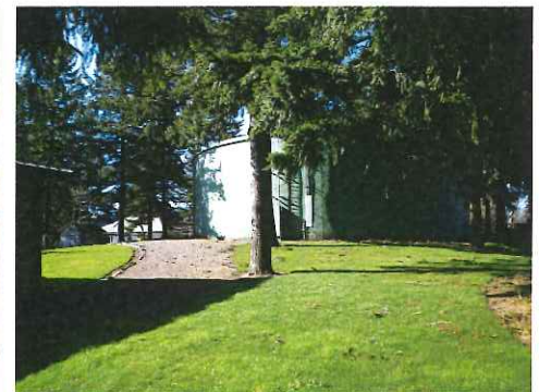
Current photo of reservoir at 141st and Glisan.