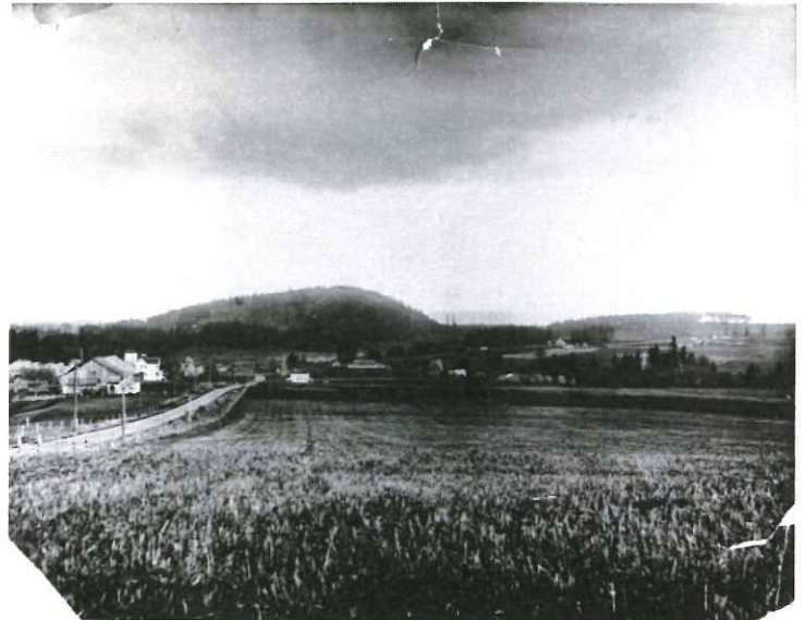
190th and Powell circa 1890s.

The first order of business was to develop a water supply. The District built its first well in 1926 and its second in 1931. In 1937 it sold bonds and built a reservoir on Grant Butte. The District continued to grow throughout the 1930s as owners of former farmland, which was turned into subdivisions, requested annexation into the Water District (Multhauf Acres and Ritlow Acres in 1939).