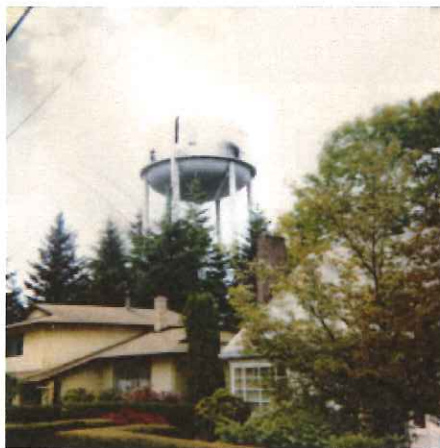
Elevated tank at 141st and Glisan. Photo taken around 1966.

In 1949 the District had to build a 200,000 gallon storage reservoir. It built an elevated tank at 141st and Glisan. The tank was replaced in 1968.