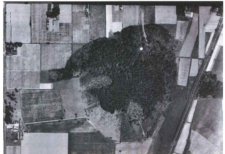
Aerial Photo of Grant Butte Reservoir taken in 1939.